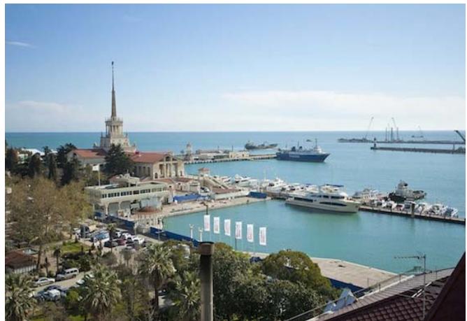
Sochi - on the Black Sea - 40 minutes from Rosa Khutor