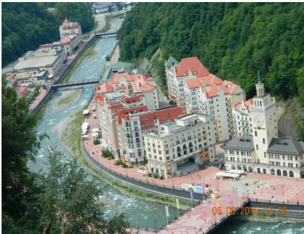
Rosa Khutor Valley