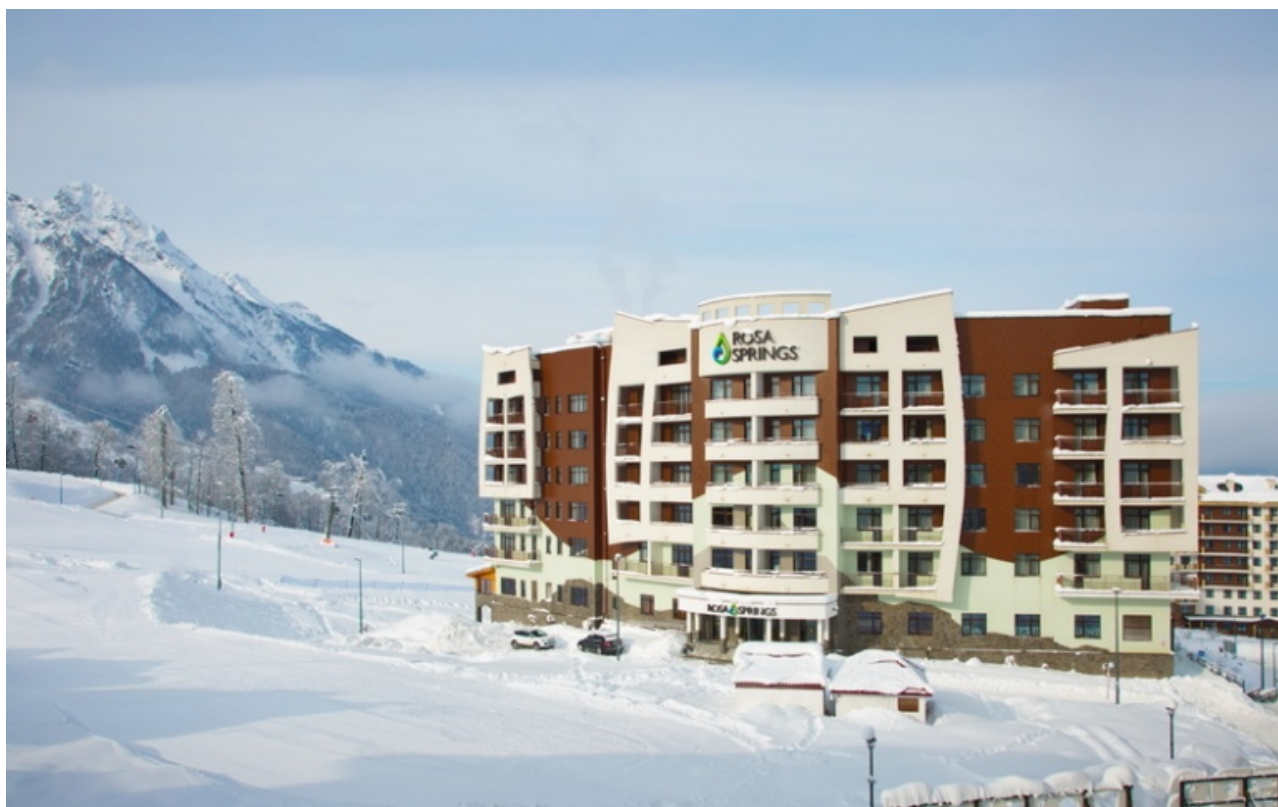
Rosa Springs Hotel 4* - the FIPS Congress Venue

At the congresses there are formal presentations, workshops, demonstrations and discussion groups that have targeted specific areas of patrolling. There are also side trips, skiing and tours. Some of the topics covered have included skier safety, training and education, medical aspects, innovations, statistics, injury types, disabled skiers, avalanche, evacuation techniques, administration of drugs, cross-country and downhill patrolling, snow board injuries, legal aspects, search and rescue, extended care, avalanche, and updates from the various countries. The FIPS Board of Directors also meets during each congress.