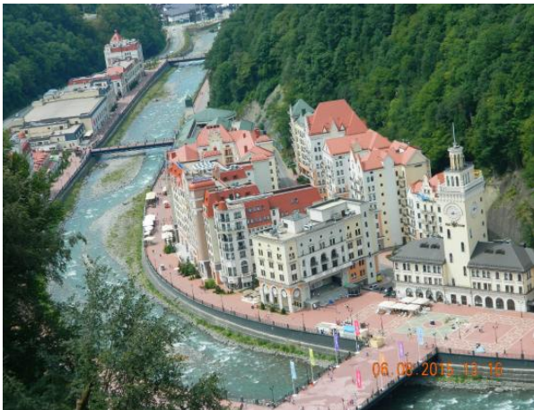
Rosa Khutor Valley