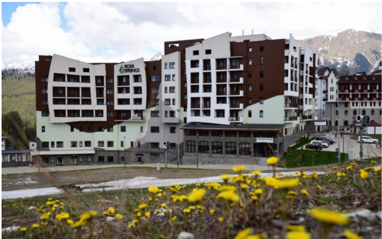
FIPS Congress venue - Rosa Springs Hotel - Rosa Khutor Plateau

At the congresses there are formal presentations, workshops, demonstrations and discussion groups that have targeted specific areas of patrolling. There are also side trips, skiing and tours. Some of the topics covered have included skier safety, training and education, medical aspects, innovations, statistics, injury types, disabled skiers, avalanche, evacuation techniques, administration of drugs, cross-country and downhill patrolling, snow board injuries, legal aspects, search and rescue, extended care, avalanche, and updates from the various countries. The FIPS Board of Directors also meets during each congress.