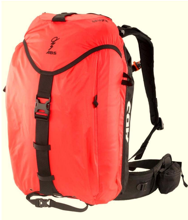
Shape of winter 12/13