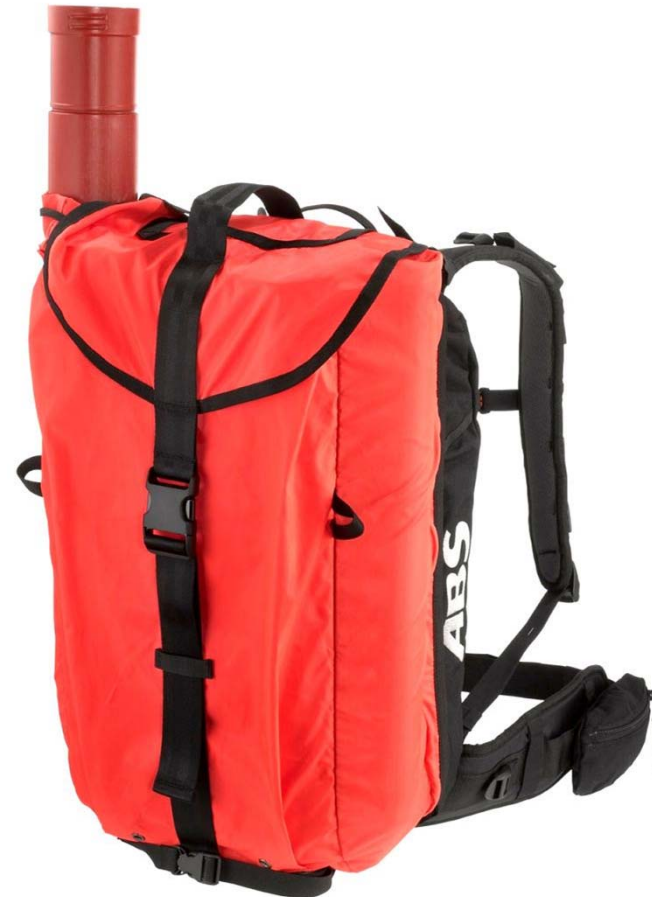
Sample of last year full