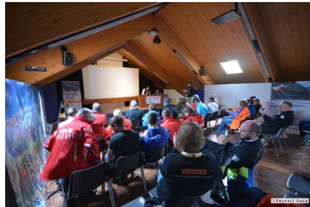
Indoor Presentations