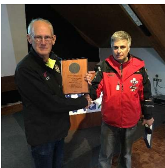
Chile presentation to Australia