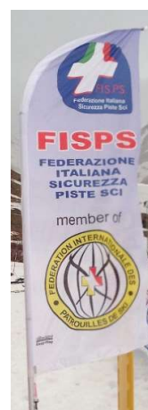
Opening Ceremony – Photos: Luca Festari, Rik Head

The Congress then consisted of a series of in-door presentations and workshops, outdoor demonstrations and multi-country practical scenarios. In addition, there were meetings of the Special Interest Groups, and national delegates also attended FIPS Board meetings and the FIPS Biennial General Meeting.