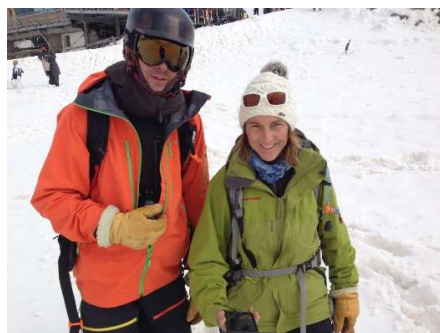
SN0G Testing - read the app disclaimers