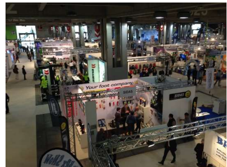
ProWinter trade show

See you all at Sochi, Russia, 13-20 January 2018