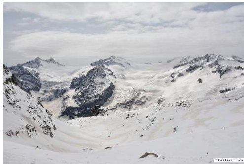
Passo Tonale in good snow

president@fips-skipatrol.org secretary@fips-skipatrol.org treasurer@fips-skipatrol.org