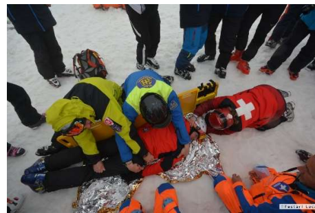
On-snow scenarios