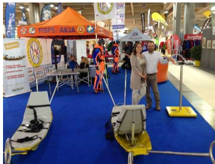
FISPS at ProWinter trade show