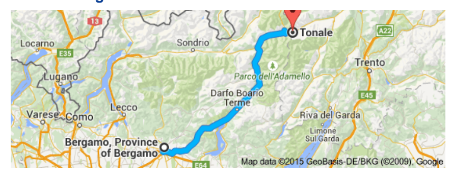
FIPS2016 Congress Information 6Jun15 Issue